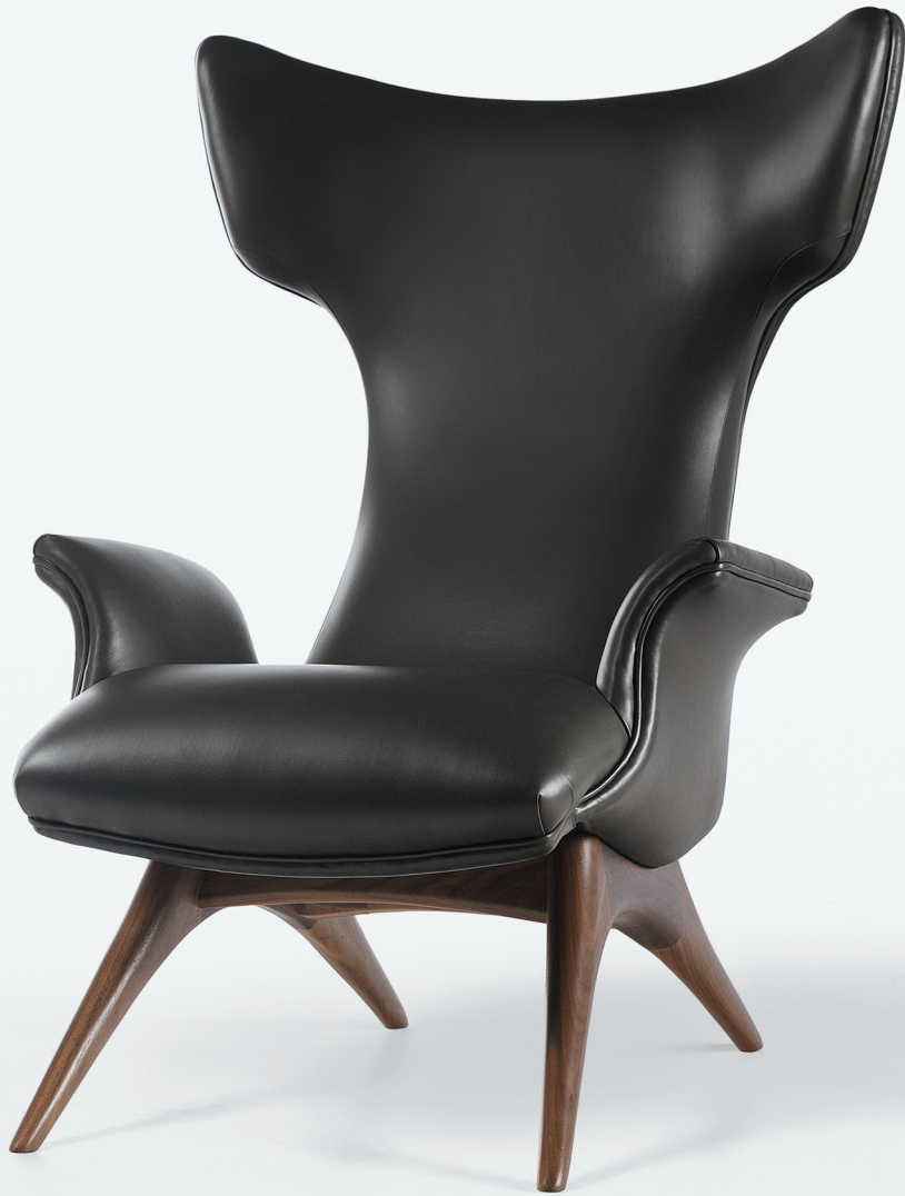
Ondine Chair Model - 530 | Designed 1958